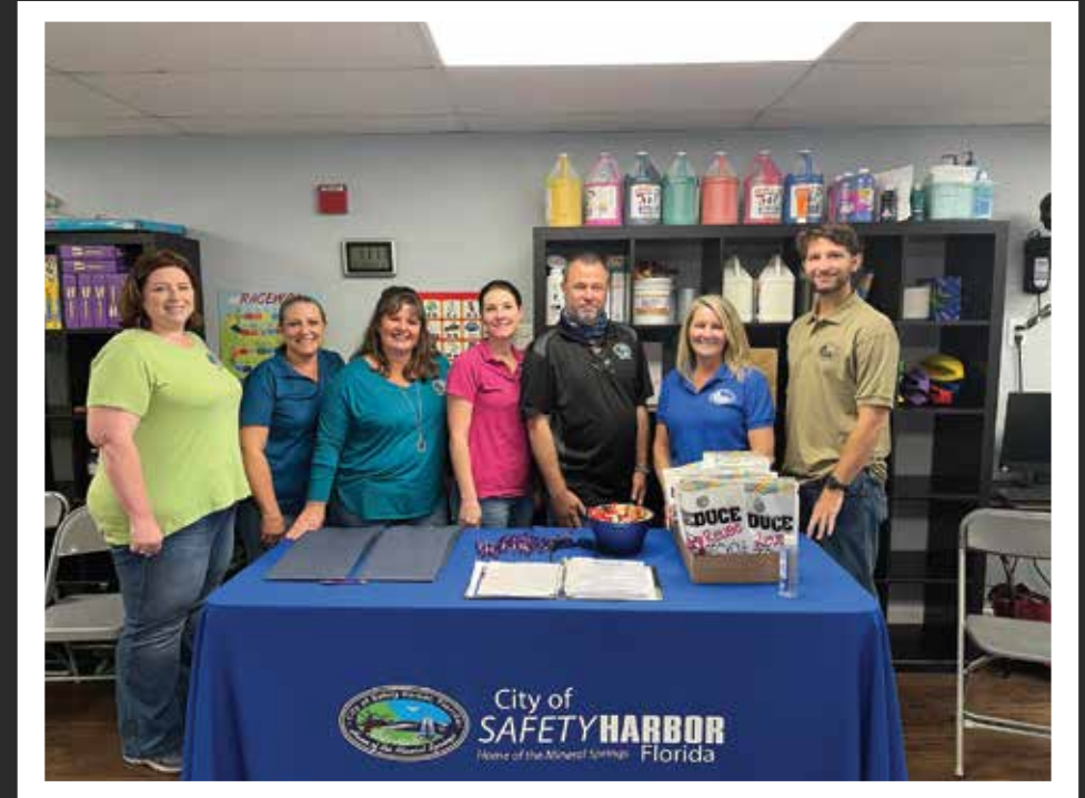
CITY STAFF PARTICIPATE IN JOB FAIRS THROUGHOUT THE YEAR