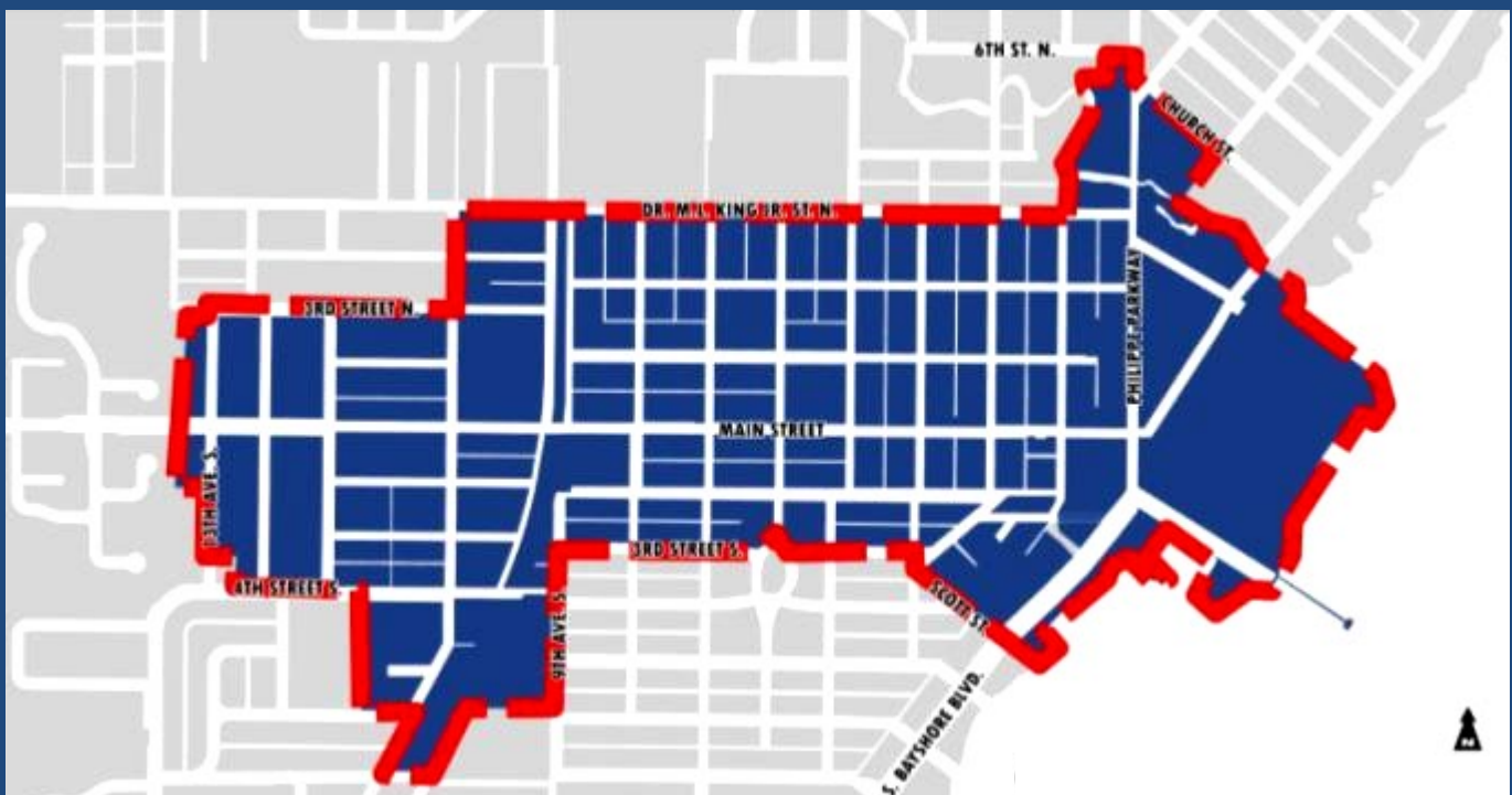
Safety Harbor Community Redevelopment Area

The CRA will continue its track record of success by building upon existing assets, proactively facilitating private sector initiatives that align with community goals, sponsoring special events and marketing the downtown as a unique destination place in the region.