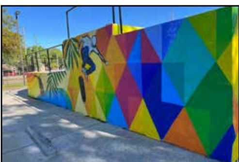
Other Park Information • Page 11