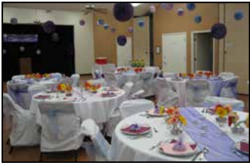
Museum & Cultural Center • Page 6