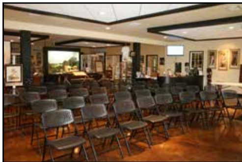
Folly Farm Nature Preserve • Page 7