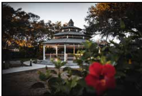
Folly Farm Farm House • Page 8