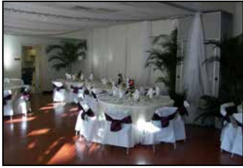
Community Center • Page 4